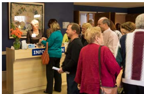
Pinch Point: Crowded Information Desk can be frustrating for visitors