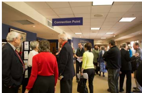
Pinch Point: Crowded Narthex makes it hard to get to Ministry Center and restrooms